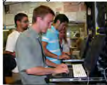
Students testing GDR Infiniband hardware

This highly-selective program is designed for third year (i.e., Junior) undergraduate students, although in some cases, Senior applicants may be considered. Acceptance into the program will be based on academic record (3.0 GPA minimum), interest and goal statement, and a letter of recommendation.