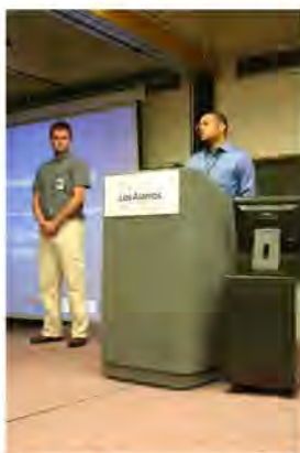
Student presentation on summer project work

During the nine-week Institute, students will receive technical training/lectures, professional development seminars, and laboratory experience with LANL staff and an experienced university instructor. A hands-on computer system laboratory/machine room fully populated with unassembled computer nodes, networking equipment, and assorted equipment, cables,