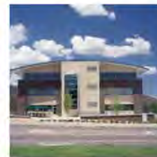
Los Alamos Research Park

As a general guideline, students should have sufficient academic achievement to make them eligible graduate school candidates upon completion of their undergraduate program. CS and EE/CE students from US universities will be considered. This program is limited to US citizens.